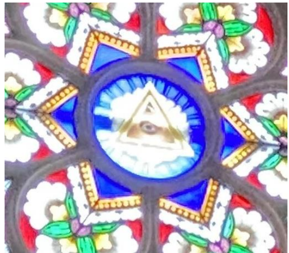
All Saints Catholic Church, 39 N Perry St, New Riegel, OH 44853